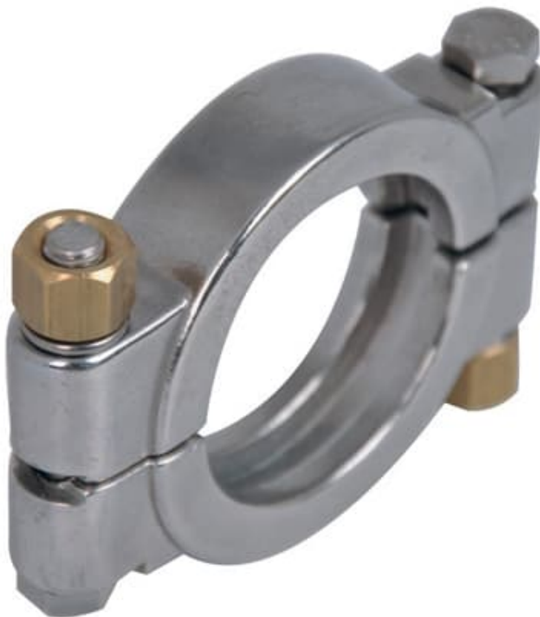
HIGH PRESSURE CLAMP Climp Material: AISI 304 (1.4301)